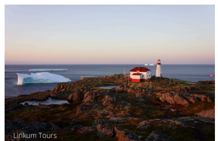
Quirpon Island Lighthouse Inn