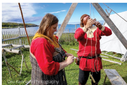
Take Your Place Among the Vikings