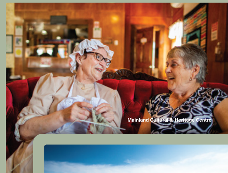
Mainland Cultural & Heritage Centre