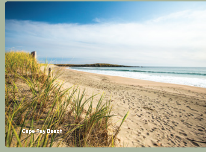
Cape Ray Beach