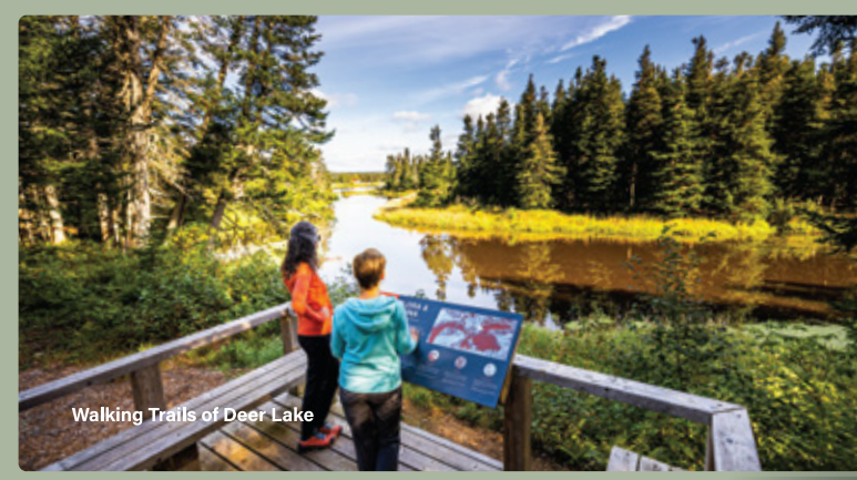
Walking Trails of Deer Lake